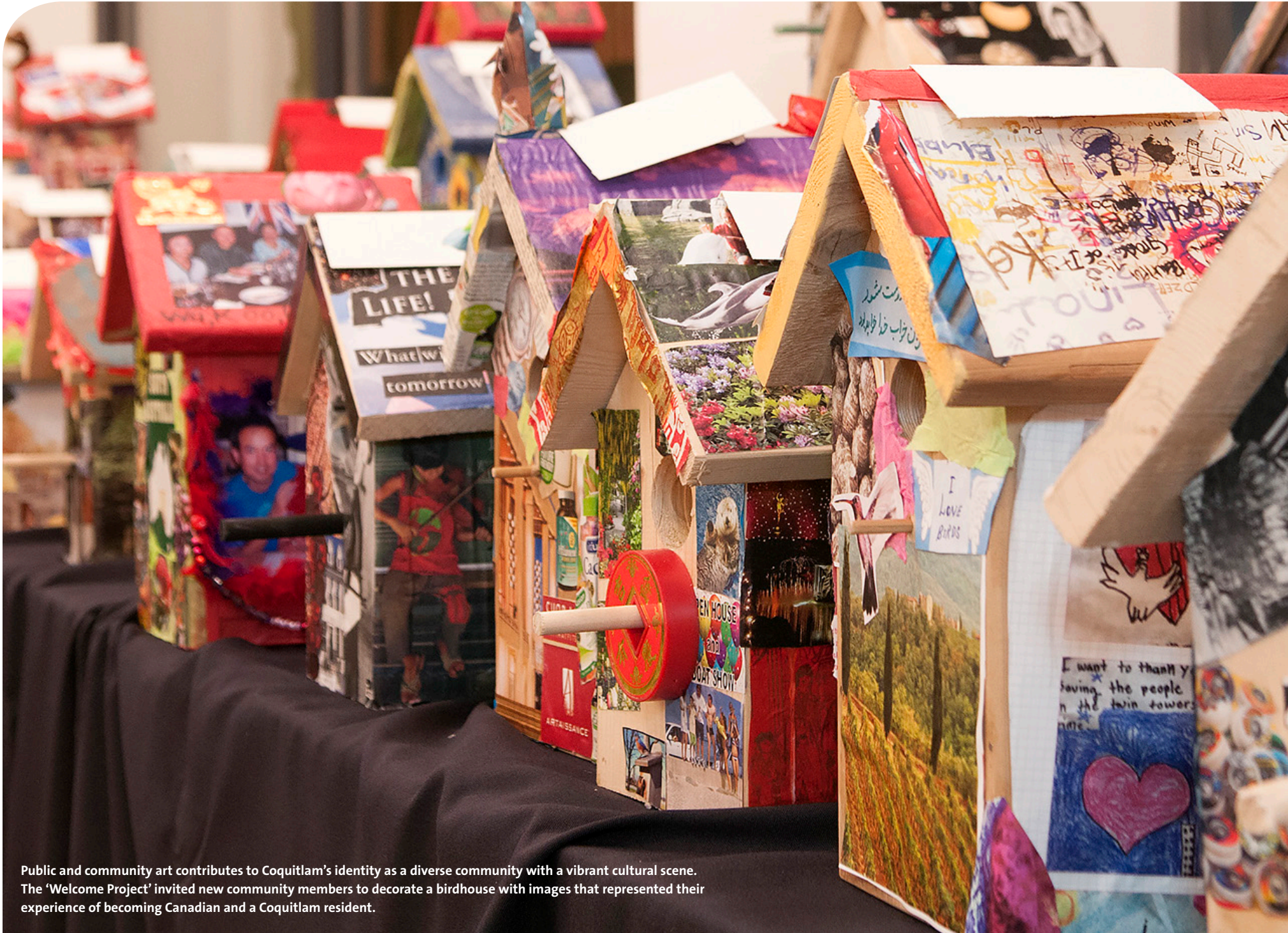
Public and community art contributes to Coquitlam's identity as a diverse community with a vibrant cultural scene. The 'Welcome Project' invited new community members to decorate a birdhouse with images that represented their experience of becoming Canadian and a Coquitlam resident.