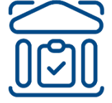
Financial Excellence and Operational Efficiency