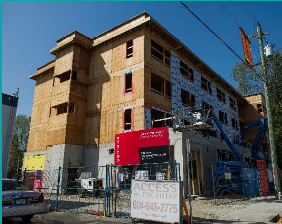
Legislative Changes and Downloading