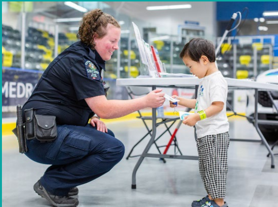
RCMP Contract Updates