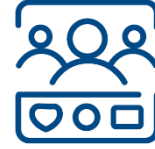
Workplace and People