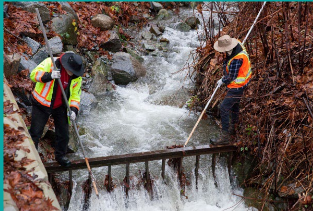
Extreme Weather Preparedness