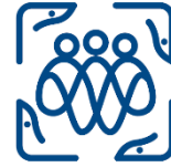
EDI, Reconciliation and Social Issues