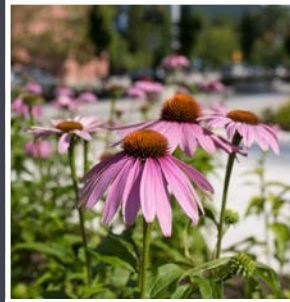
Coneflower Echinacea spp.