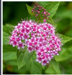
Spiraea Spiraea spp.