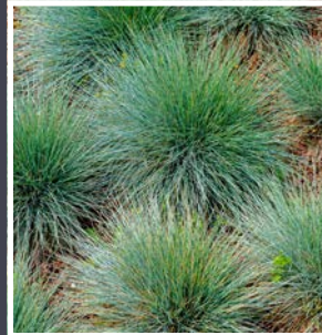
Blue Fescue Grass Festuca glauca