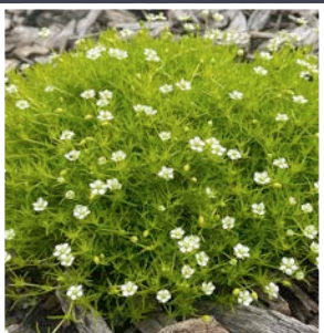
Irish Moss Sagina subulata