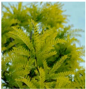
Sunburst Honeylocust Gleditsia triacanthos