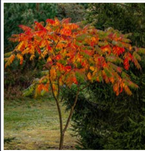
Smooth Sumac Rhus glabra