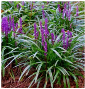
Lily Turf Liriope spicata