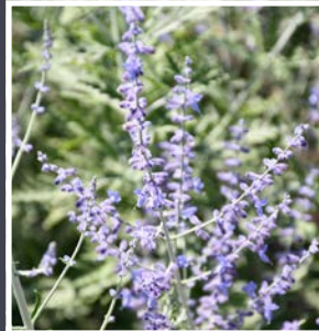
Russian Sage Perovskia atriplicifolia