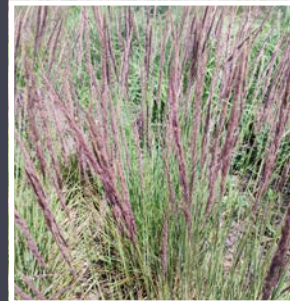
Little Bluestem Schizachyrium scoparium