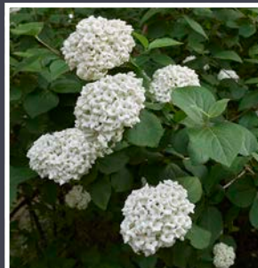
Snowball Viburnum Viburnum carlcephalum