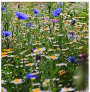
Water Wise Lawn Mixes