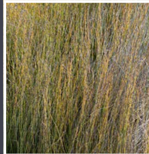
Bluebunch Wheatgrass Pseudoroegneria spicata