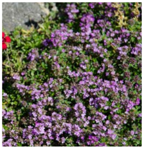
Creeping Thyme Thymus serpyllum