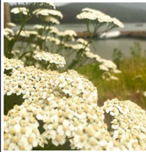
Yarrow Achillea millefolium