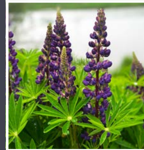
Lupine Lupinus x hybrida