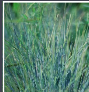
Blue Oat Grass Helictichon semoervirens