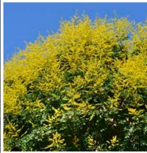
Golden Raintree Koelreuteria paniculata