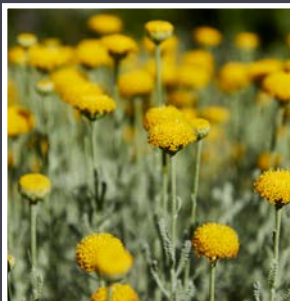
Grey Lavender Santolina Santolina chamaecyparissu

Note: All plants, even drought-tolerant ones, require deep and consistent watering until their roots are established.