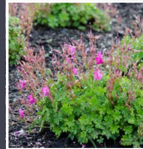
Bigroot Geranium Geranium macrorrhizum