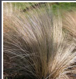
Mexican Feather Grass Nassella tenuissima