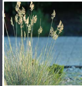
Blue Hair Grass Koeleria glauca