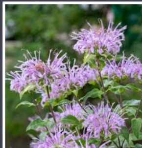
Wild Bergamot Monarda fistulosa