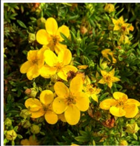
Shrubby Cinquefoil Potentilla fruticosa