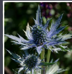
Sea Holly Eryngium planum