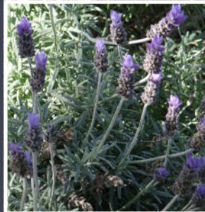
Lavender Lavandula angustifolia