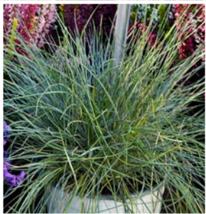
Sheep Fescue Festuca ovina