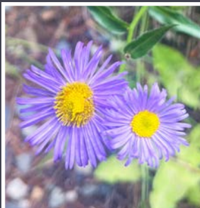
Showy Daisy Erigeron speciosus