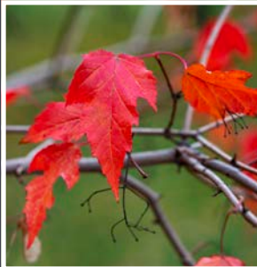
Amur Maple Acer ginnala