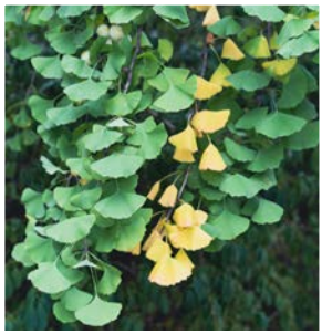
Ginkgo/Maidenhair Ginkgo Bilboa