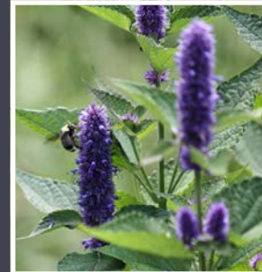
Anise Hyssop Agastache foeniculum