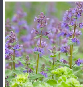
Catmint Nepeta spp.