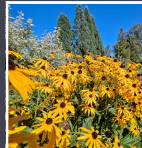
Black-Eyed Susan Rudbeckia hirta