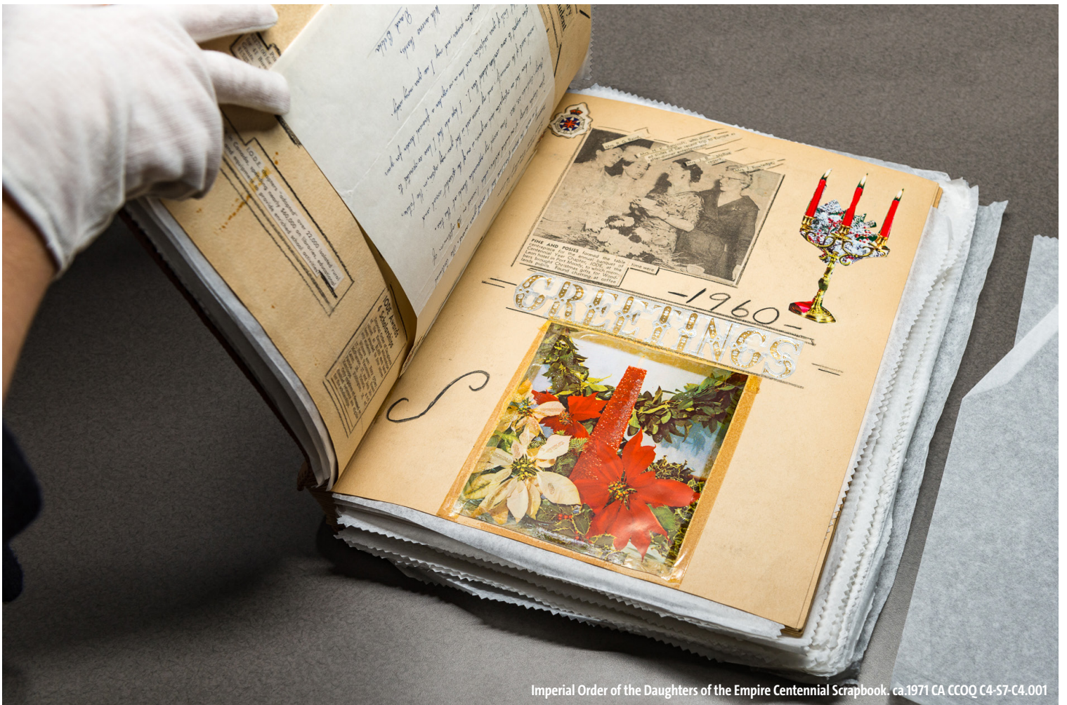
Imperial Order of the Daughters of the Empire Centennial Scrapbook, ca.1971 CA CCOQ C4-S7-C4.001